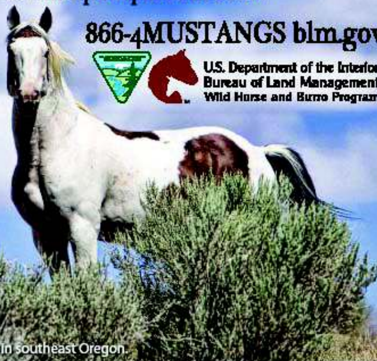
South Steens Herd Management Area in southeast Oregon

U.S. Department of the Interior Bureau of Land Management Wild Horse and Burro Program