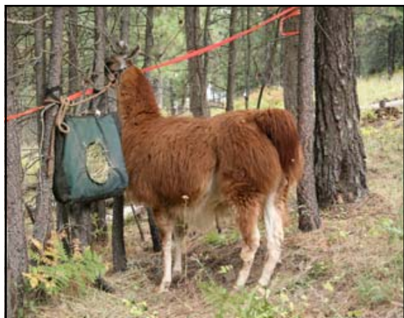
Llama that spooked a few horses