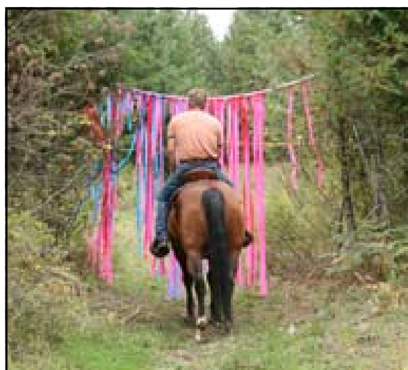
Tom Knoll challenging the Wall of Stripes