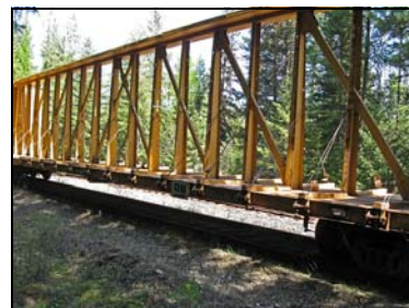
One of the approximately 25 cars blocking the trail.