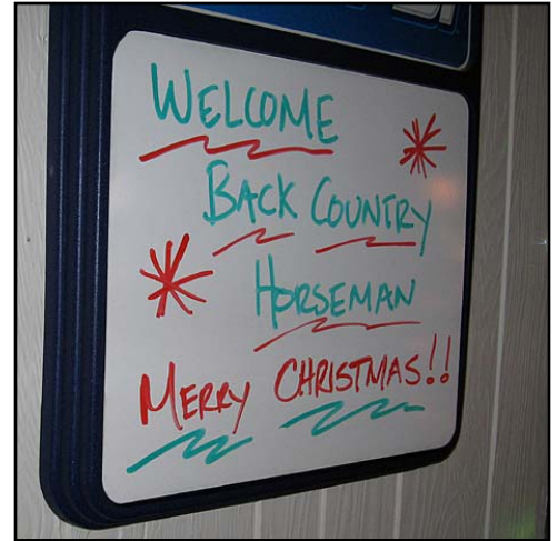
Our Welcome Sign at Avondale